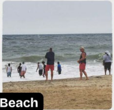
Annual BBQ & Day at the Beach