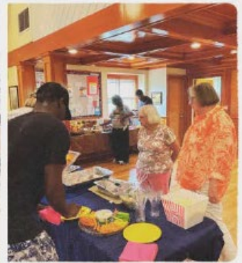
With Camp Faith from Camden